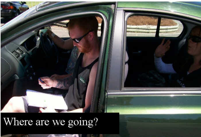
Where are we going?

The organizers would like to thank NZ Credit Union Baywide, The Rose and Shamrock and Arataki Honey for their generous support.