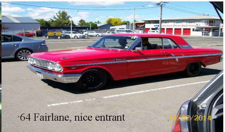
'64 Fairlane, nice entrant