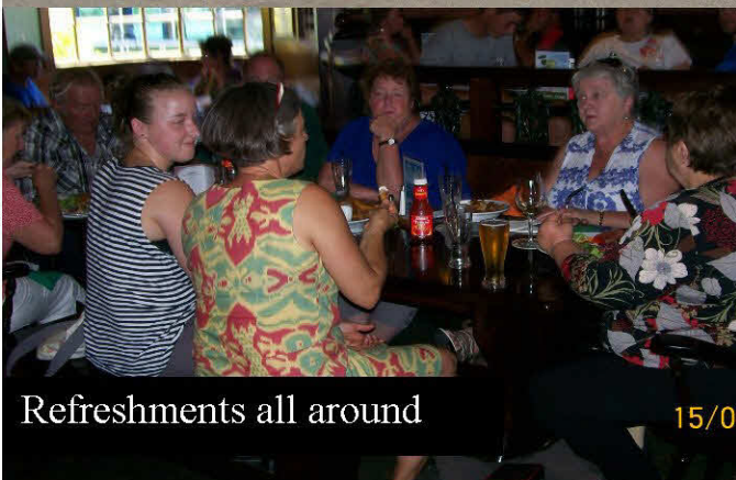
Refreshments all around