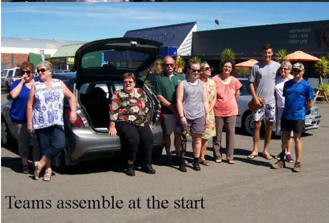
Teams assemble at the start