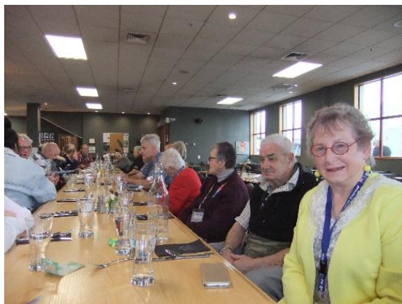
Invercargill meeting 2020

A year ago I started this newsletter by saying we are still being covid-19 alert; well a lot has happened but we are still following our Covid protocols. Where I am located (Invercargill) we have started to get that first little nip of winter - a sign of what to expect for the next 3 to 4 months. Your Committee is still meeting by Zoom which seems to work well and the lack of travel is great. Last newsletter missed out on a couple of photos as proof we have been together so here they are now.